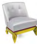
CAPRICE Limited edition