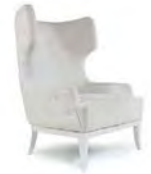
SOFT & CREAMY