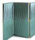
HIDE & SEEK