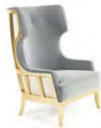
SOFT & CREAMY Limited edition