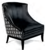
HERITAGE Limited edition