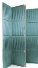
HIDE & SEEK