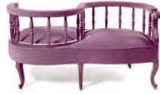
YES NO MAYBE SO