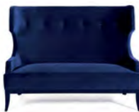
SOFT & CREAMY