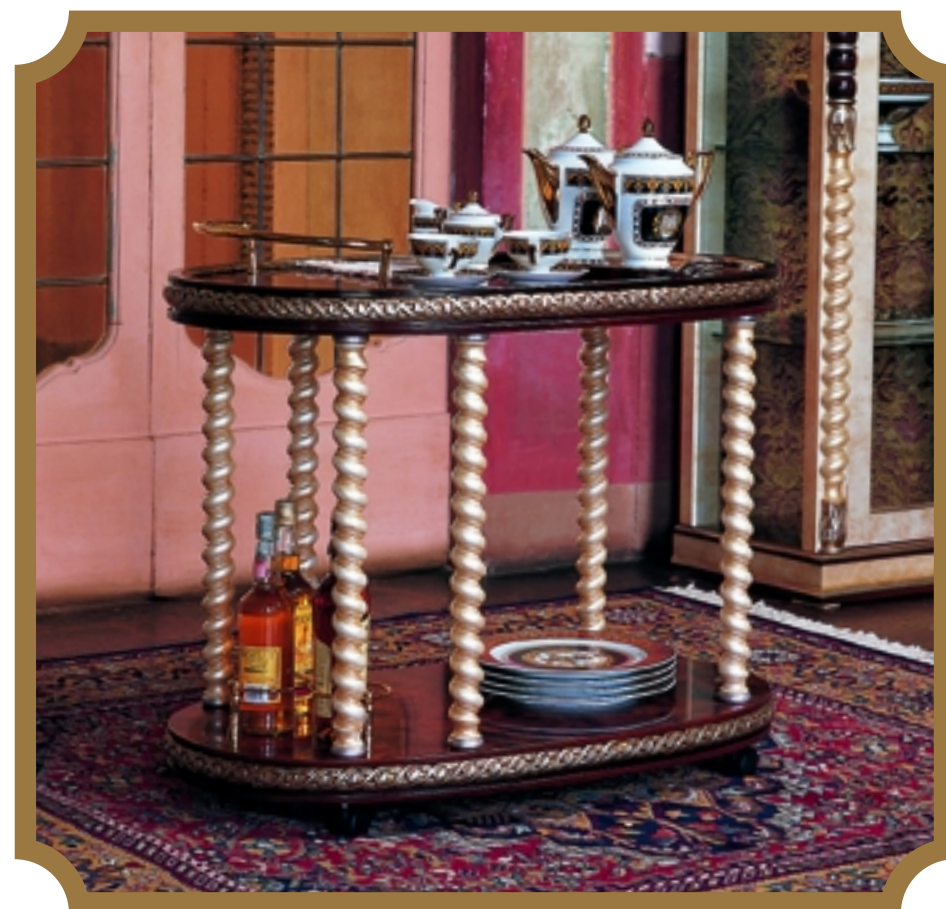
CRI 24 Trolley (cm.52 x 92 x H.80)