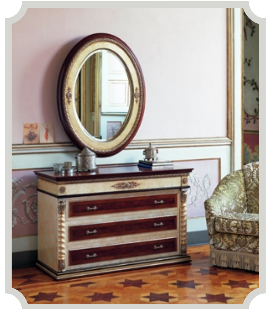
CRI 04b Oval mirror for chest of drawers (cm.90 x H.115)