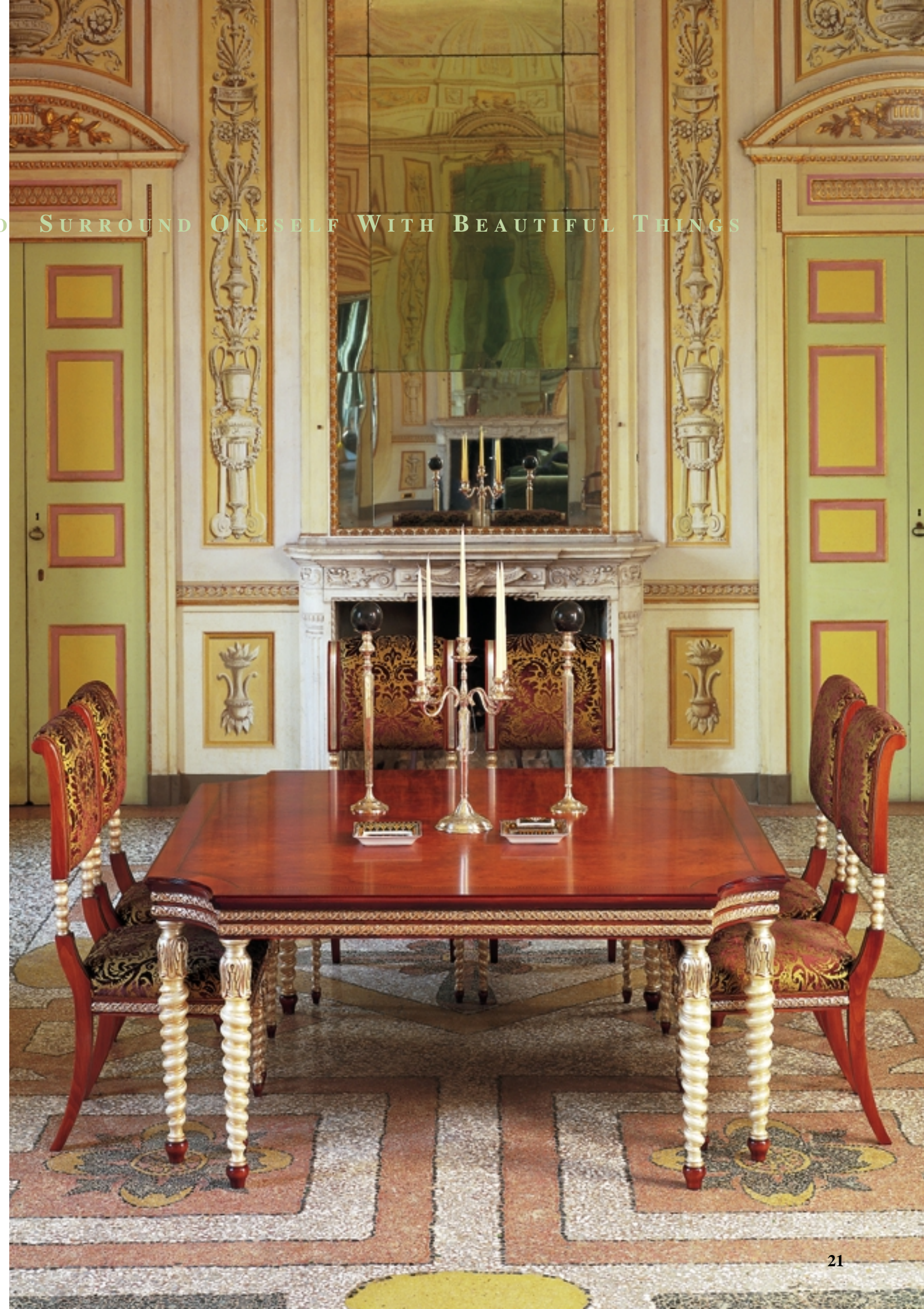
CRI 16 Dining chair (cm.60 x 55 x H.118)