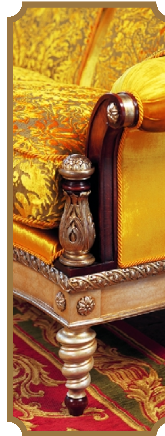
CRI 43 3 Seaters sofa (cm.240 x 95 x H.100)