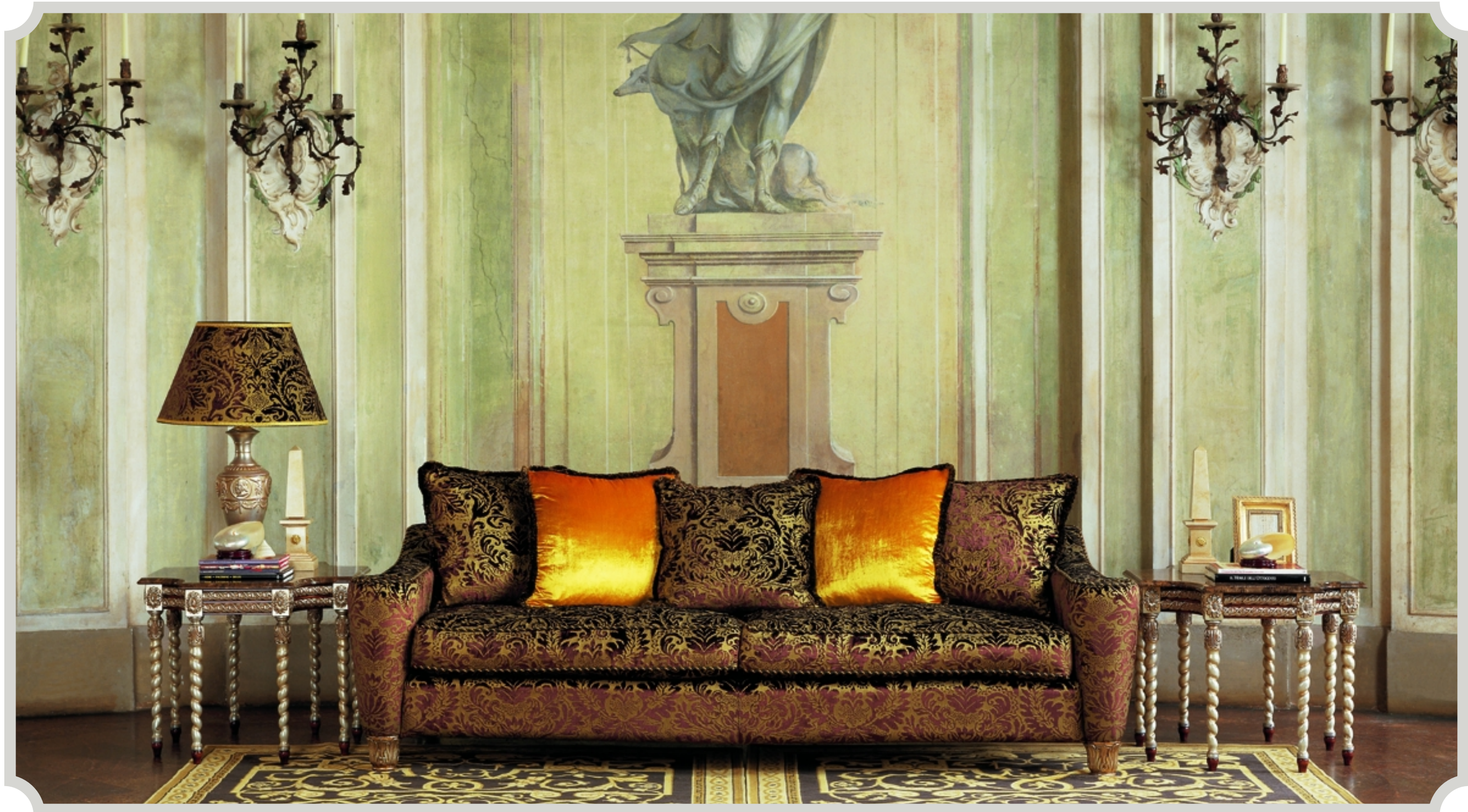
CRI 47 Side table 8 legs whit marble top (cm.70 x 70 x H.55)