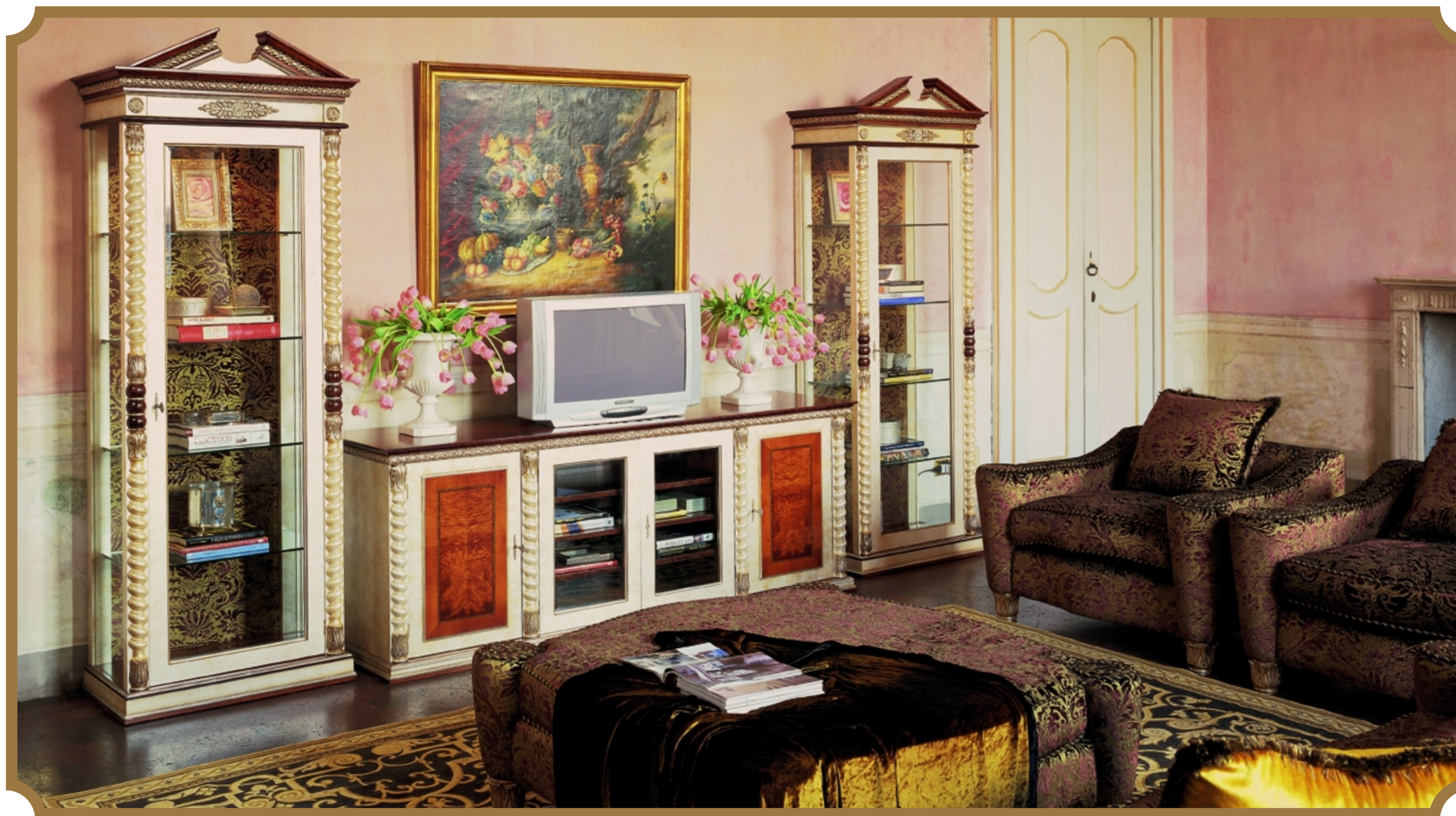
CRI 13b 1 door vetrine (cm.80 x 46 x H.220)

A PLACE ONLY FOR ONESELF, TO THINK, TO WORK, TO DREAM OR TO MEET FRIENDS ALWAYS WITH GREAT ELEGANCE