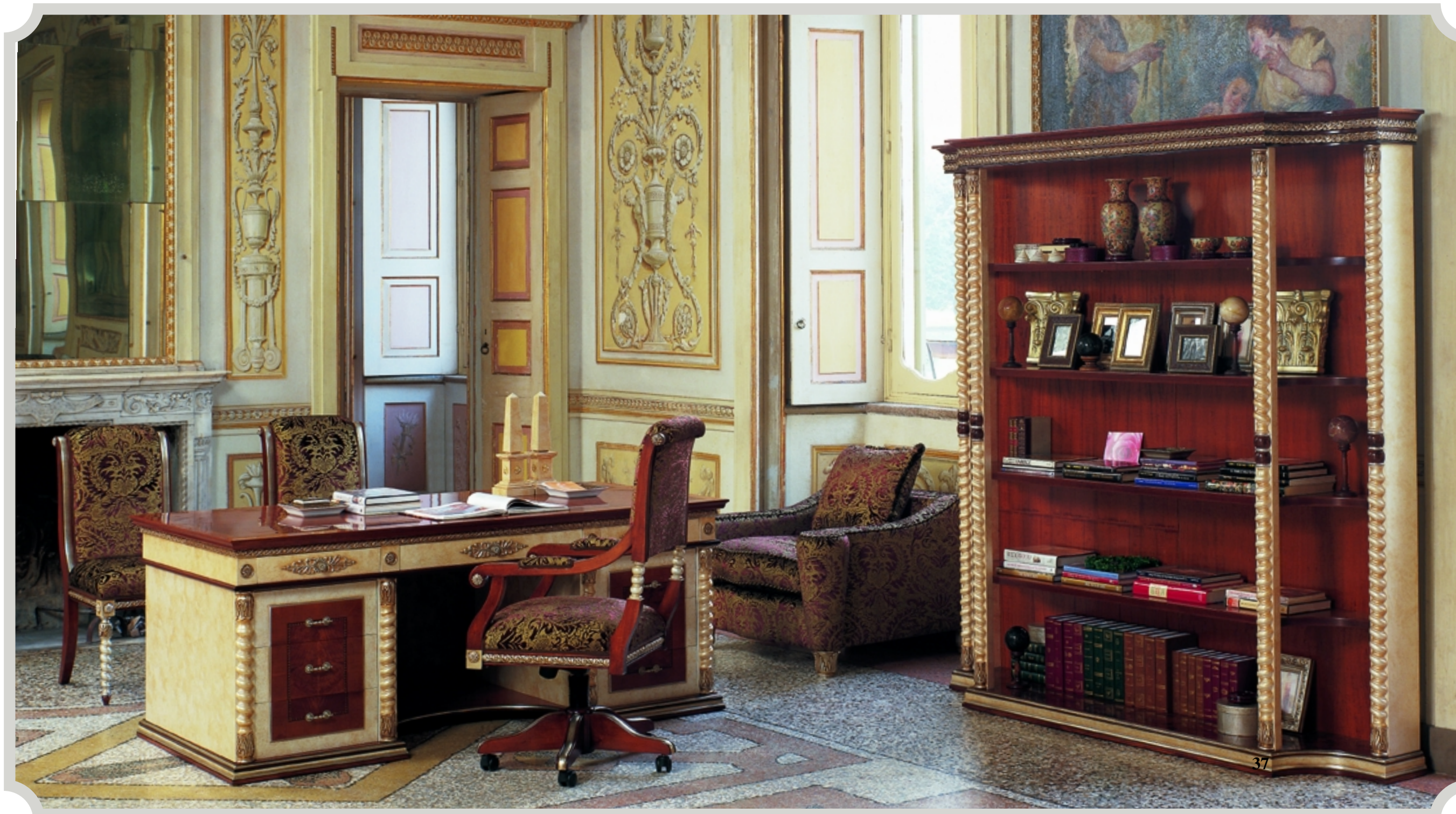
CRI 31 Writing desk (cm.100 x 200 x H.85)