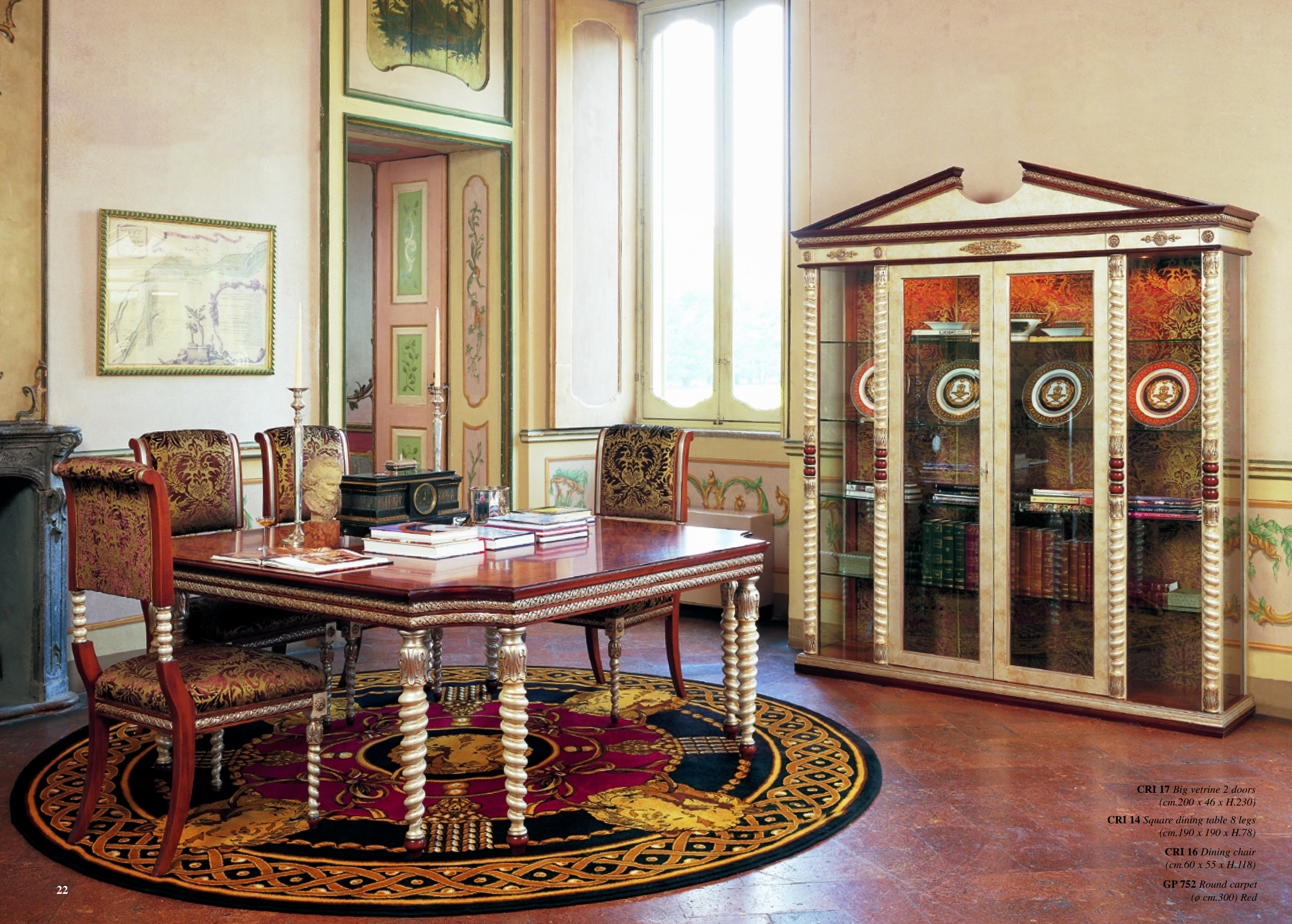
CRI 17 Big vetrine 2 doors (cm.200 x 46 x H.230)