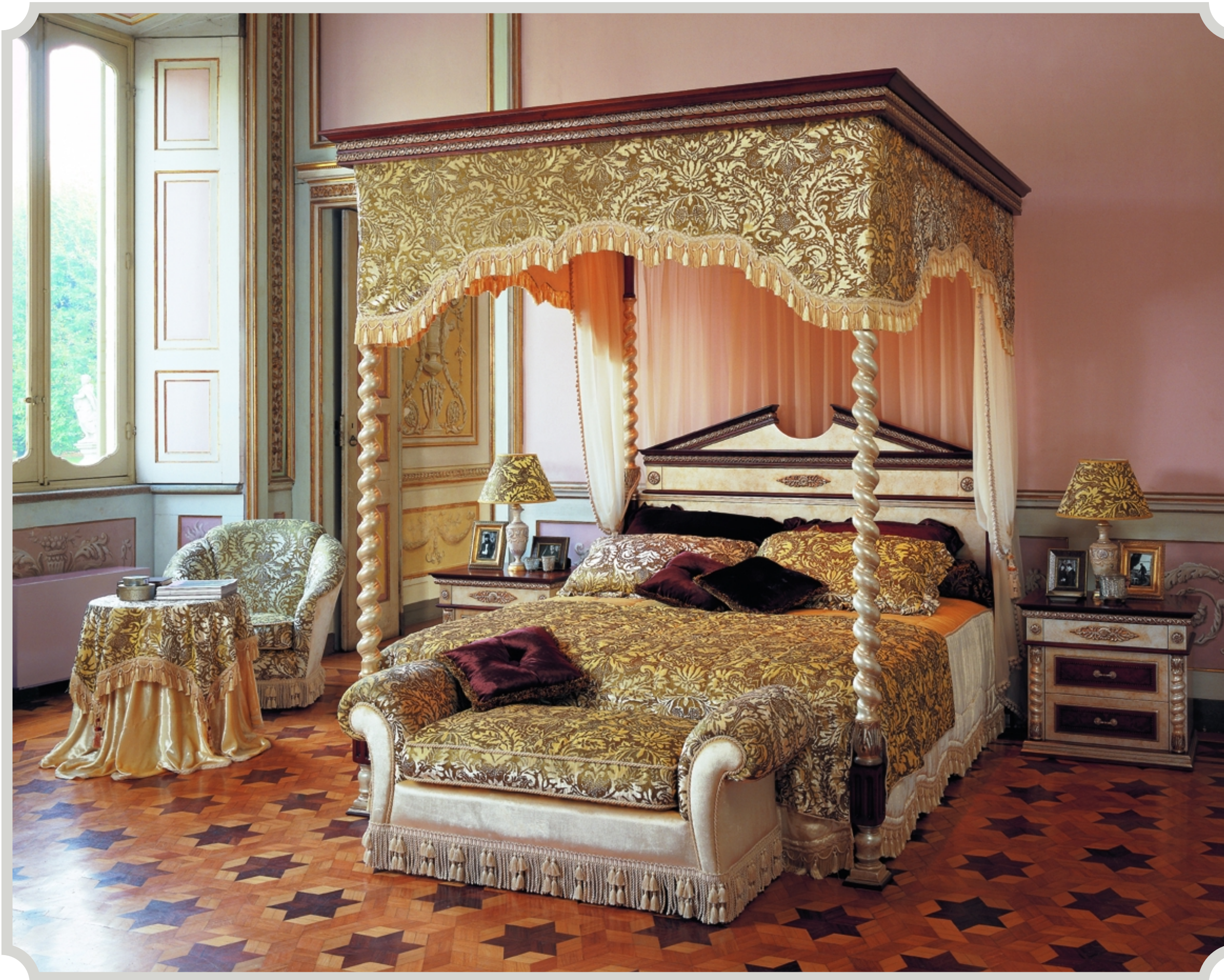
ELE 58 Elena Abilliè table ( \phi cm.60 x H.70) ELE 51 Elena arm-chair (cm.88 x 90 x H.90) CRI 07i Padded bench (cm.140 x 45 x H.50)