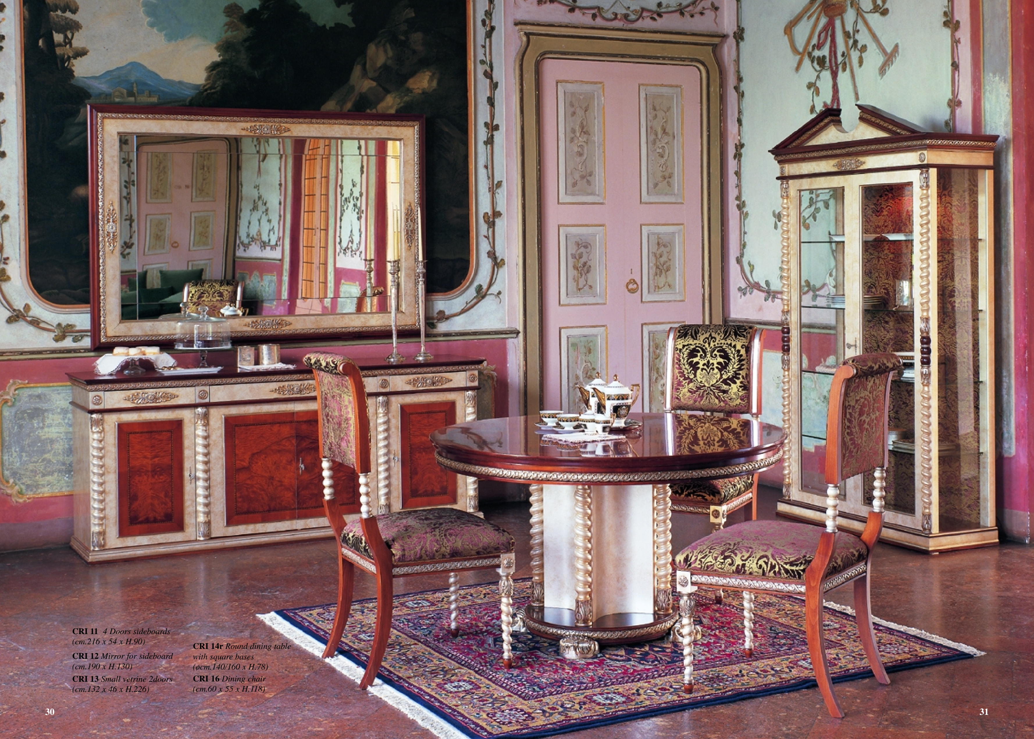
CRI 11 4 Doors sideboards (cm.216 x 54 x H.90)