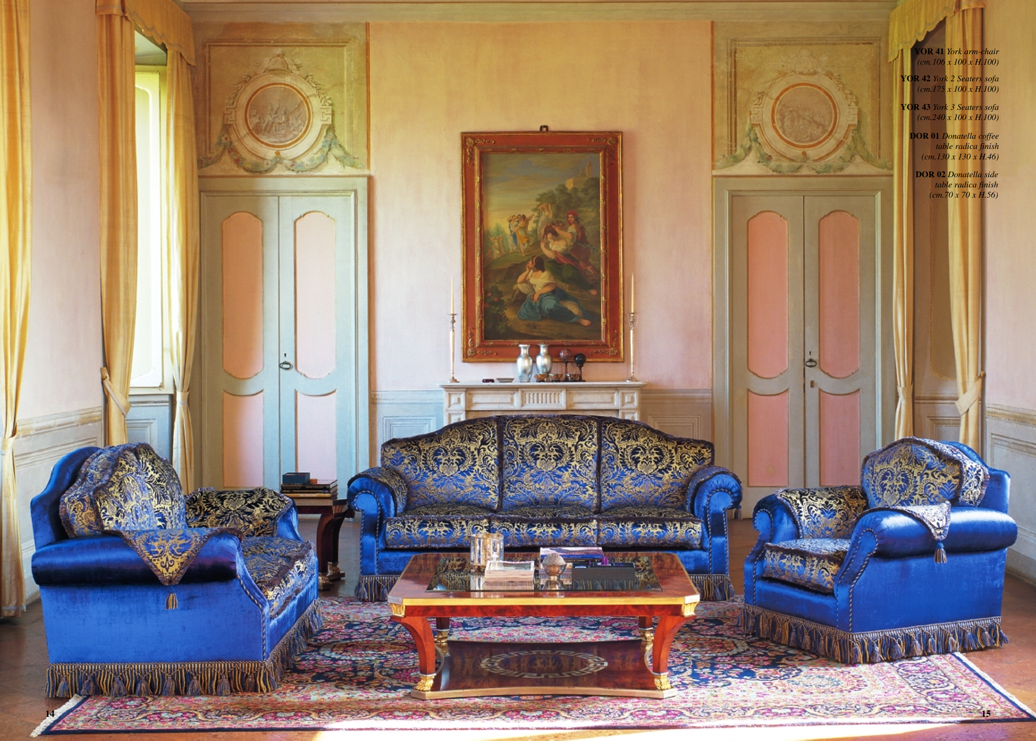
YOR 41 York arm-chair (cm.106 x 100 x H.100)