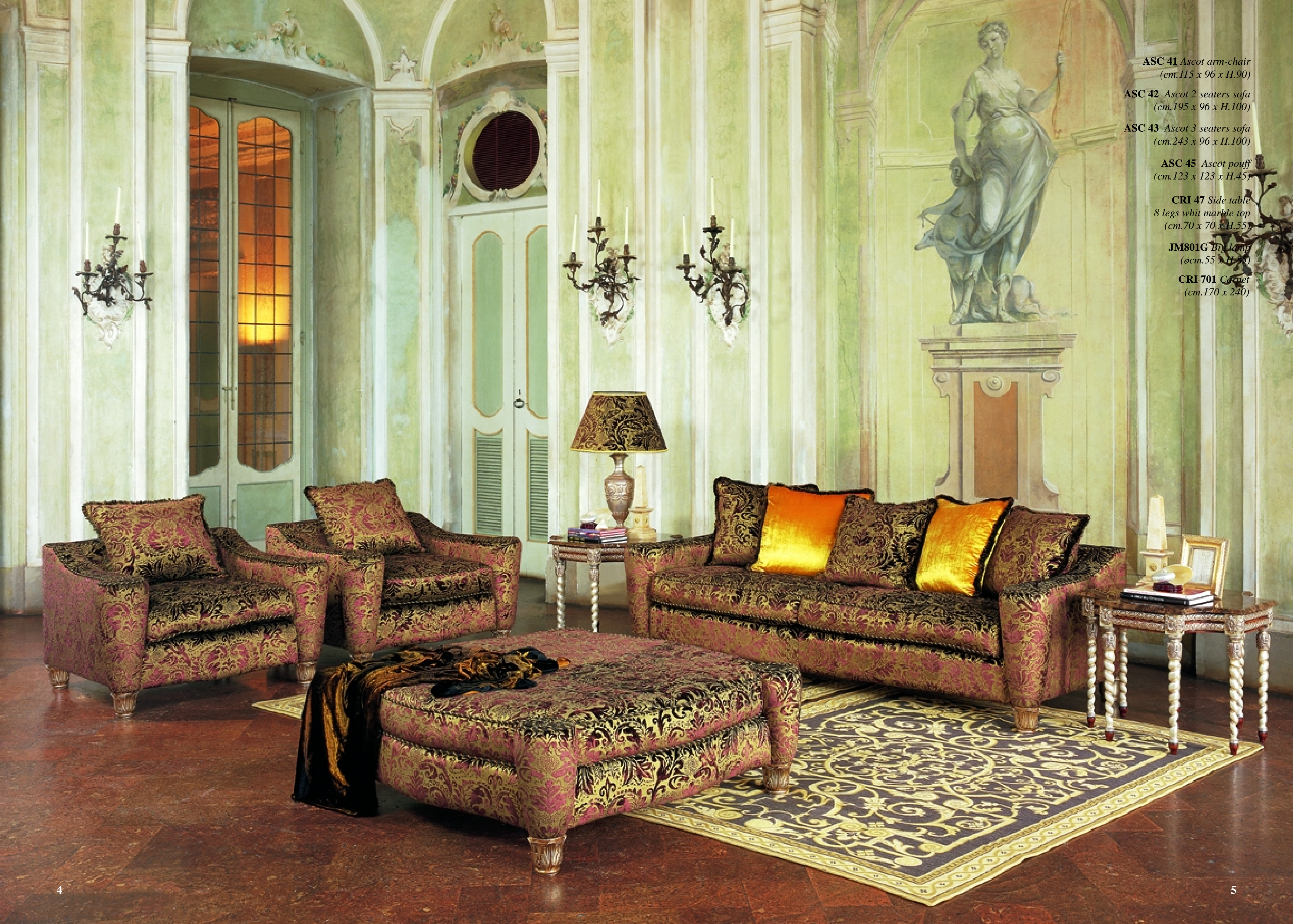
ASC 41 Ascot arm-chair (cm.115 x 96 x H.90)