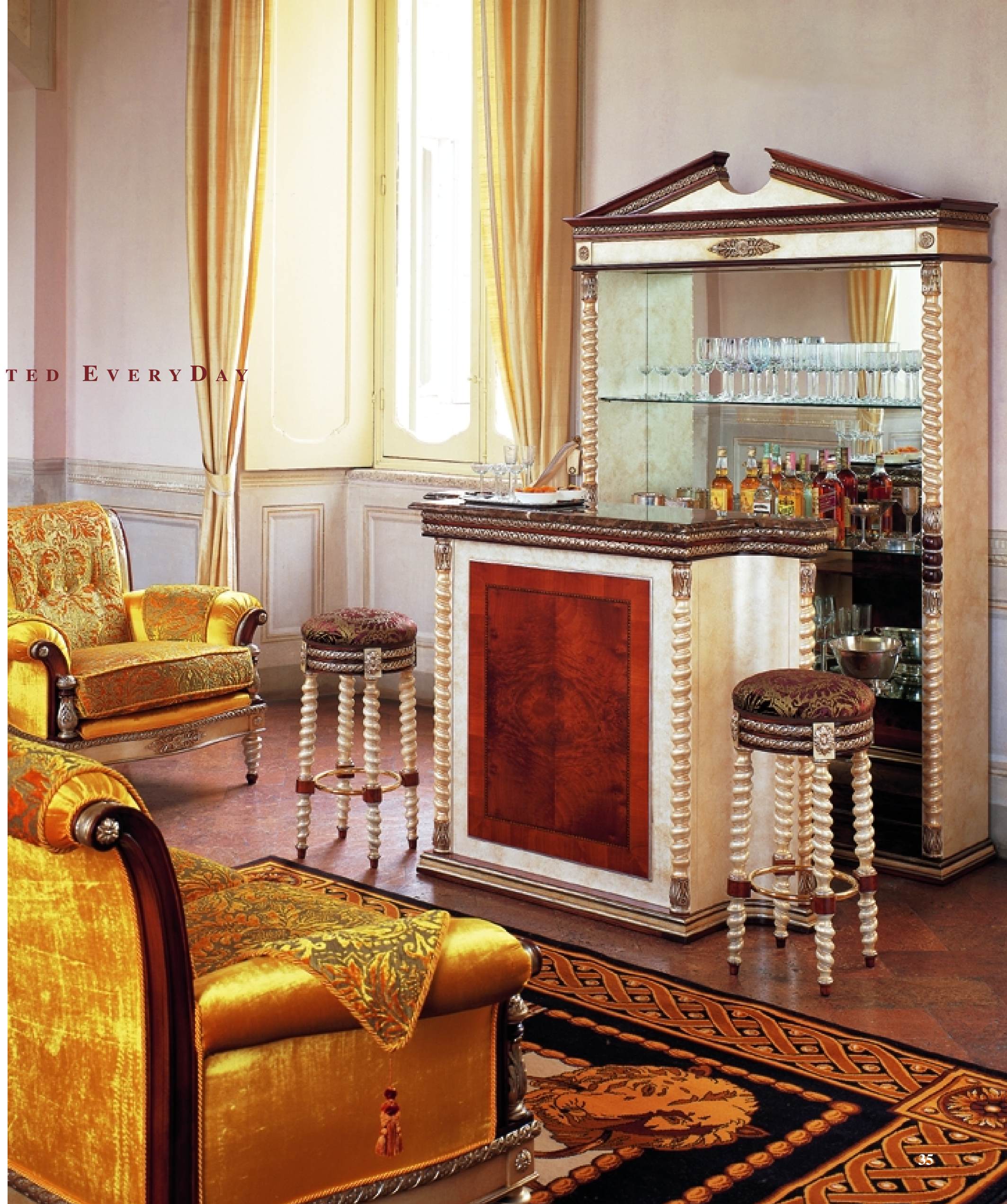
CRI 28 Bar stool ( \phi cm.40 x H.75)