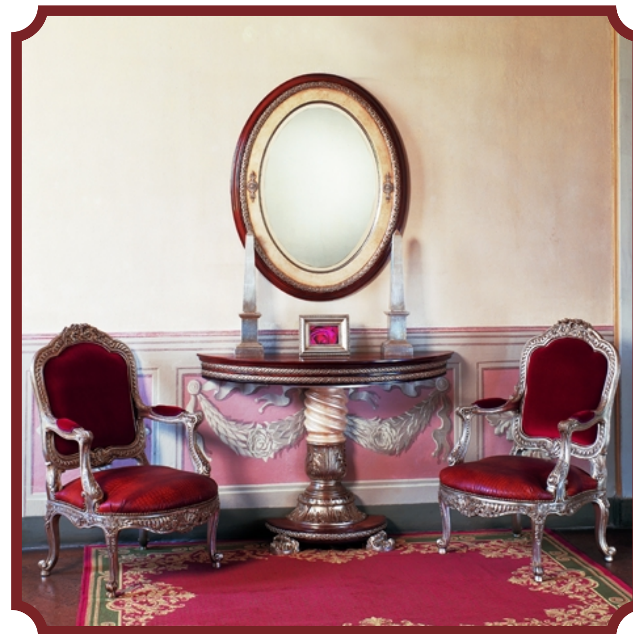
EAT 51 Eaton arm-chair (cm.70 x 70 x H.110)