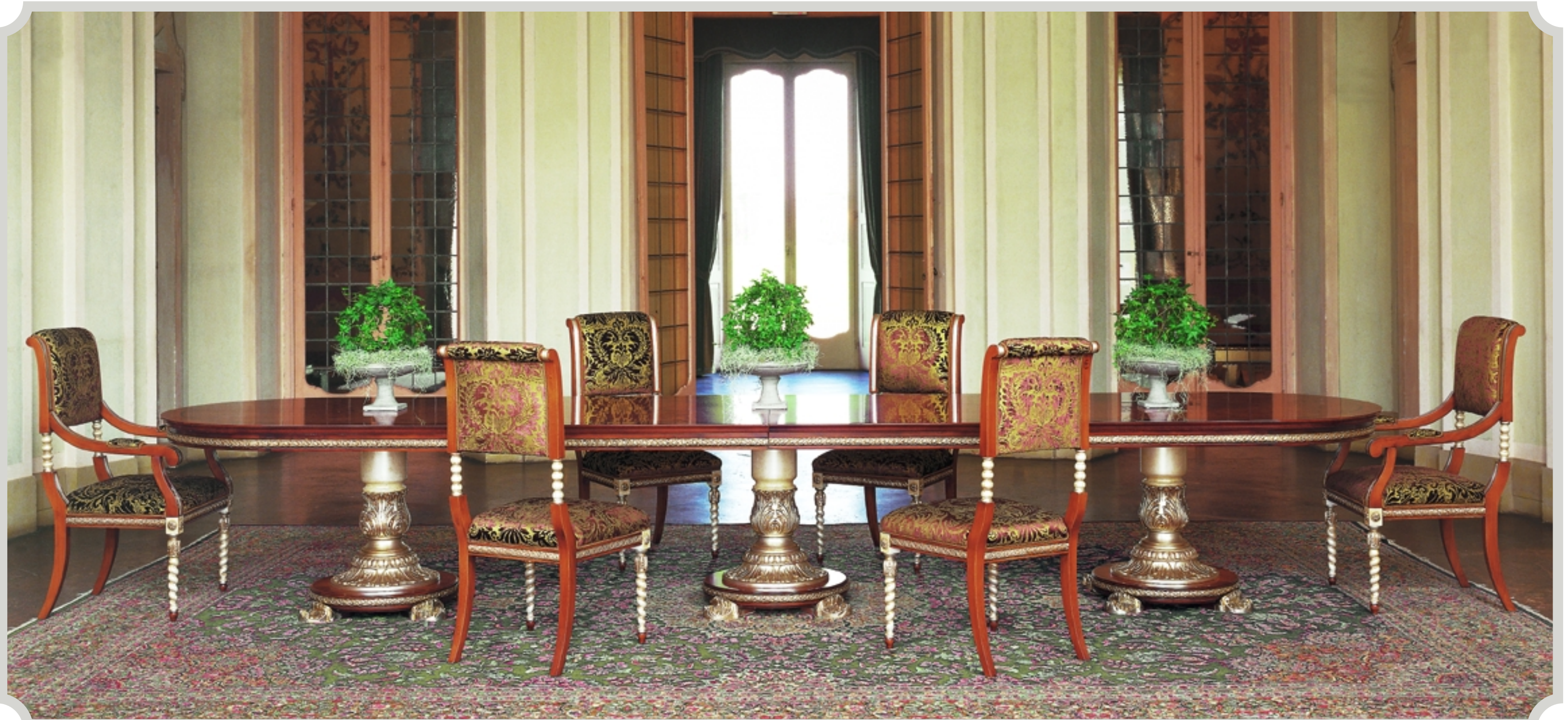
CRI 15 Dining arm-chair (cm.60 x 60 x H.118)

WIDE SPACES OF ANCIENT RESIDENCES OR SMALL ROOMS FOR ONE'S HOME PRIVACY. EVERYTHINGS OF THIS IS PART OF OUR LIVES AND SECRET DREAMS.