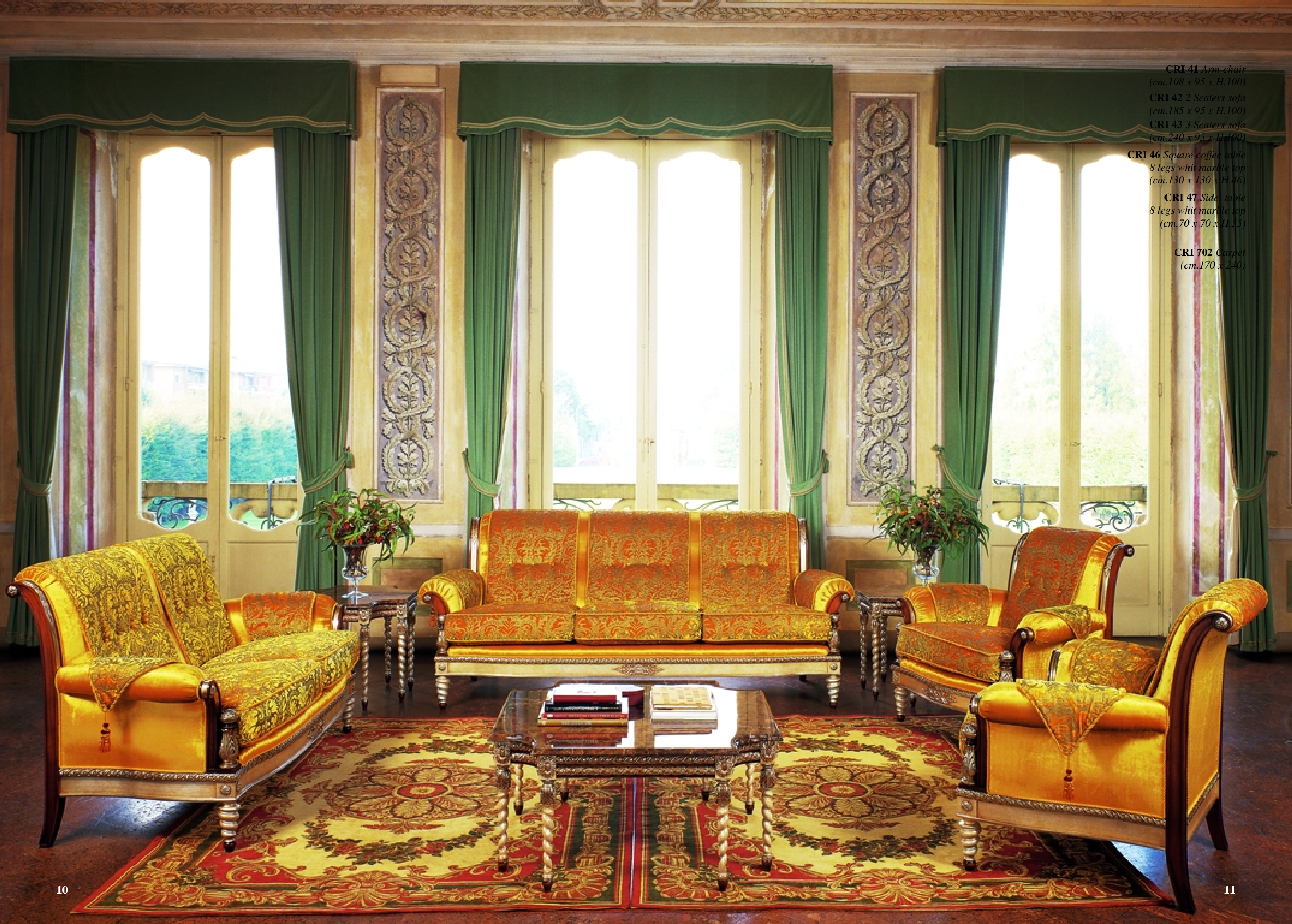
CRI 41 Arm-chair (cm.108 x 95 x H.100)