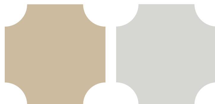
CRI 14 Square dining table 8 legs (cm.190 x 190 x H.78)